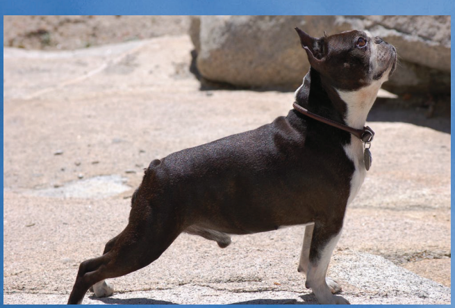
BUTLER - 2013