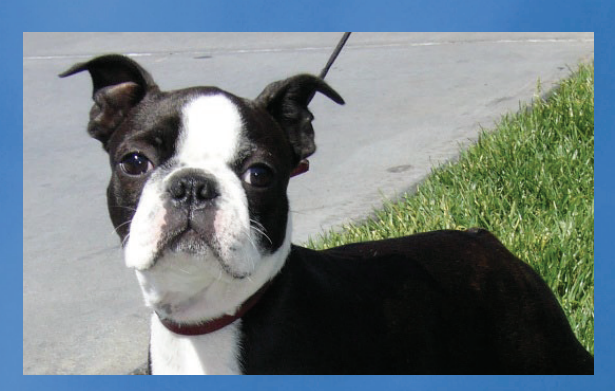
BABY BUTLER - 2005