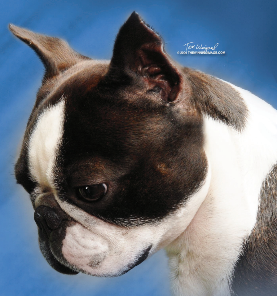
Best in Show Camellia Capital Kennel Club May 2006

EUKANUBA BEST OF BREED AKC/EUKANUBA NATIONAL CHAMPIONSHIP SHOW 2006